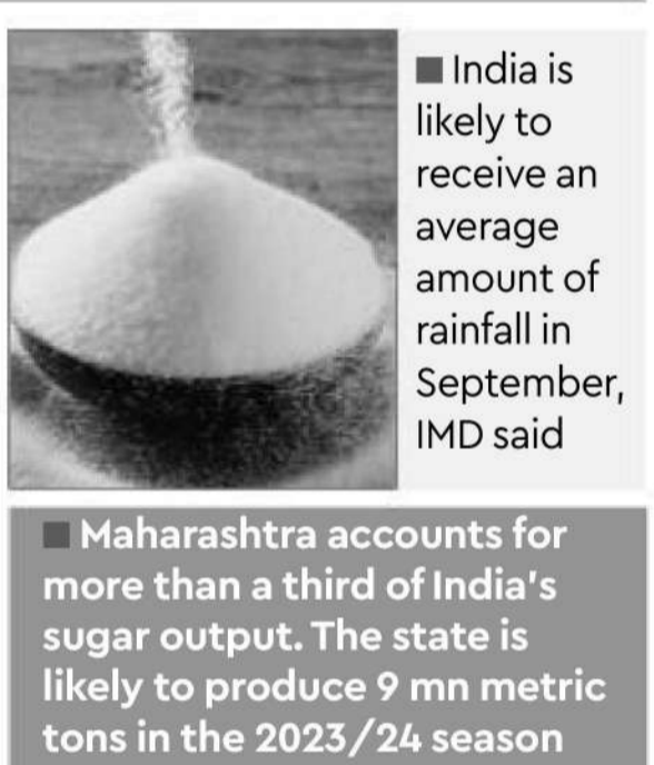
■ Maharashtra accounts for more than a third of India's sugar output. The state is likely to produce 9 mn metric tons in the 2023/24 season